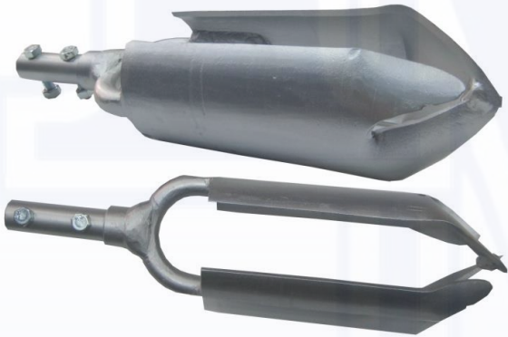
1 pc Auger Bucket Type Head