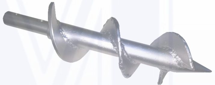
1 pc Auger Screw Type Head