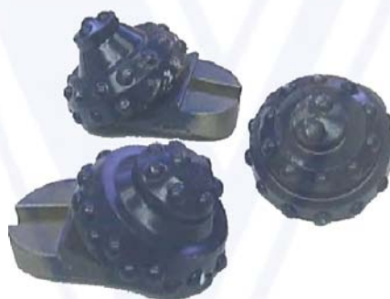
Cone before Assembly